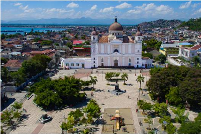
Cathedral and the parade ground in the historic center of Cap-Haïtien

Historic Haiti” is carried and spotlighted by the Management Organization of Northern Destination Haïti, OGDNH (French abbreviation). This non-profit organization's mission is to develop and reinforce the values of the tourism sector and to validly present it to worldwide tourism