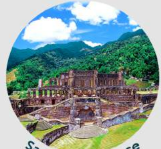
Sans Souci Palace