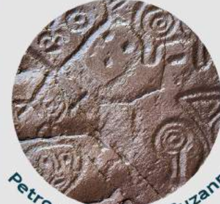
Petroglyphs sainte Suzanne